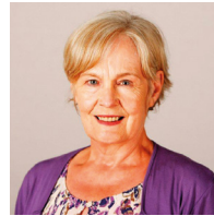
Deputy Convener Mary Scanlon Scottish Conservative and Unionist Party