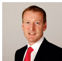
Tavish Scott Scottish Liberal Democrats