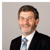
Nigel Don Scottish National Party