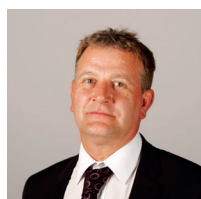
David Torrance Scottish National Party

Note: The membership of the Committee changed during the period covered by this report, as follows: