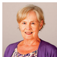
Deputy Convener Mary Scanlon Scottish Conservative and Unionist Party