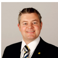
Stuart McMillan Scottish National Party