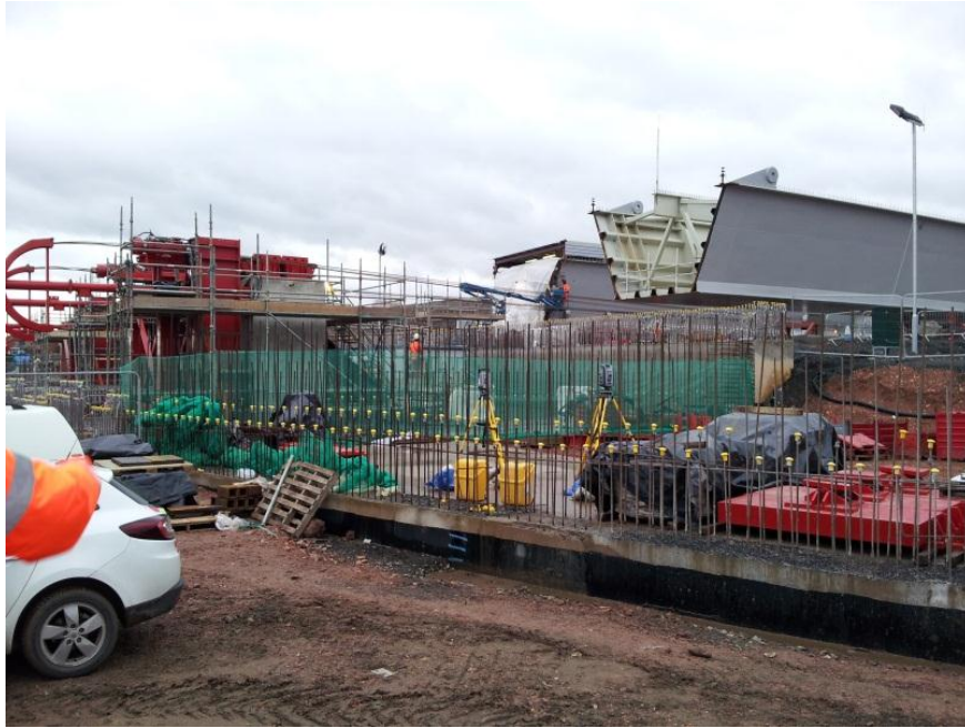
Photo 4 – Post launches of both carriageways of the South approach viaduct steelwork