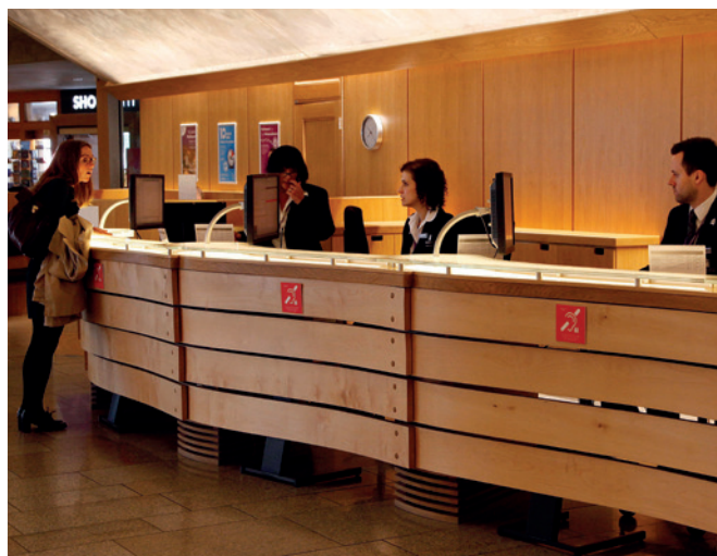
The Visitor Information Desk

Visitor Services Staff at the Visitor Information Desk and at other locations in the Main Hall can help if you want to attend a meeting of the Parliament or go on a guided tour. They can also help if you have a question about the Parliament or need anything on your visit. If you've an appointment with an MSP or member of staff, give the staff at the Visitor Information Desk the name of the person you've arranged to meet or the event you're attending and they'll show you where to wait.