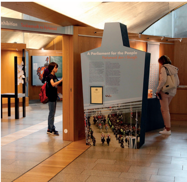
The Main Hall exhibition

Most of the waiting areas are in the Main Hall, but there's also another waiting room. The Main Hall can be a busy, noisy area on days when lots of people are visiting. If you would like to sit in a quieter area, please speak to a member of staff.