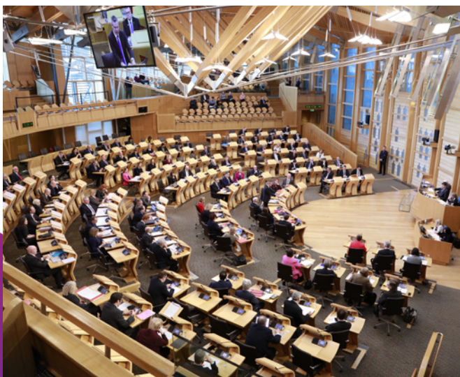
A meeting of the Parliament in the Debating Chamber

Many areas of the Parliament building have hearing loops, including the Visitor Information Desk, the baggage store and the public café. You can also ask for a headset to listen to meetings in the Debating Chamber or a committee room.