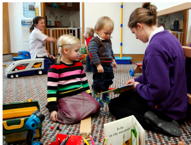
Children playing in the crèche

There is a free crèche on the ground floor where you can leave children aged under six while you visit the Scottish Parliament. The crèche is closed at weekends and public holidays. It's a good idea to book a place at the crèche before you come to the Parliament by emailing creche@parliament.scot or calling 0131 348 6192 .