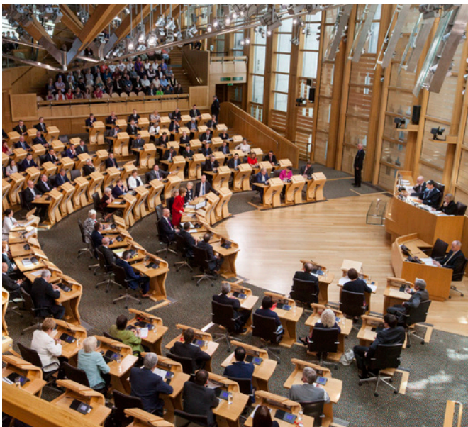
A meeting of the Parliament in the Debating Chamber

At times when MSPs aren't meeting in the Debating Chamber, visitors can normally go and have a look at it from the public gallery.