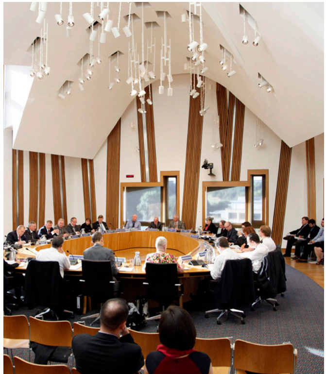
A committee meeting in a committee room

There are six committee rooms at the Scottish Parliament: two on the ground floor, two on the first floor and two on the fourth floor. All the rooms have lots of spotlights, and the rooms on the fourth floor also have lots of natural light.