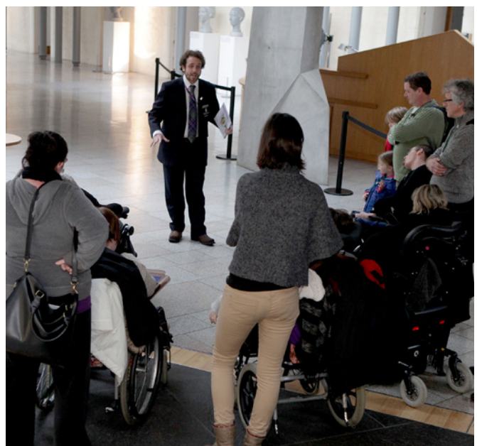
A guided tour group in the Garden Lobby

On the standard Parliament tour, your guide will describe what happens in the different areas of the building and talk about the history and design of the building. We also have a range of other tours on history, art and literature. These tend to be more interactive or conversational and may go into parts of the building that are not included on the standard Parliament tour.