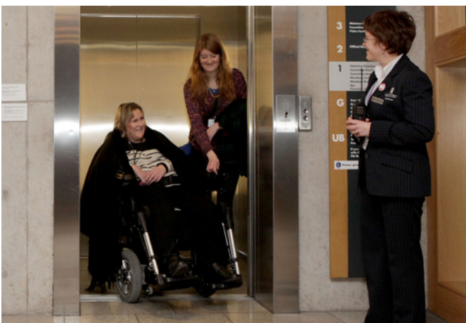
Visitors using a lift

The building is fully accessible to people in wheelchairs, and there are Changing Places toilets on the ground floor. You can borrow a wheelchair from the Visitor Information Desk to use when you're at the Parliament. Contact Visitor Services in advance if you want to make sure a wheelchair is available on your visit.