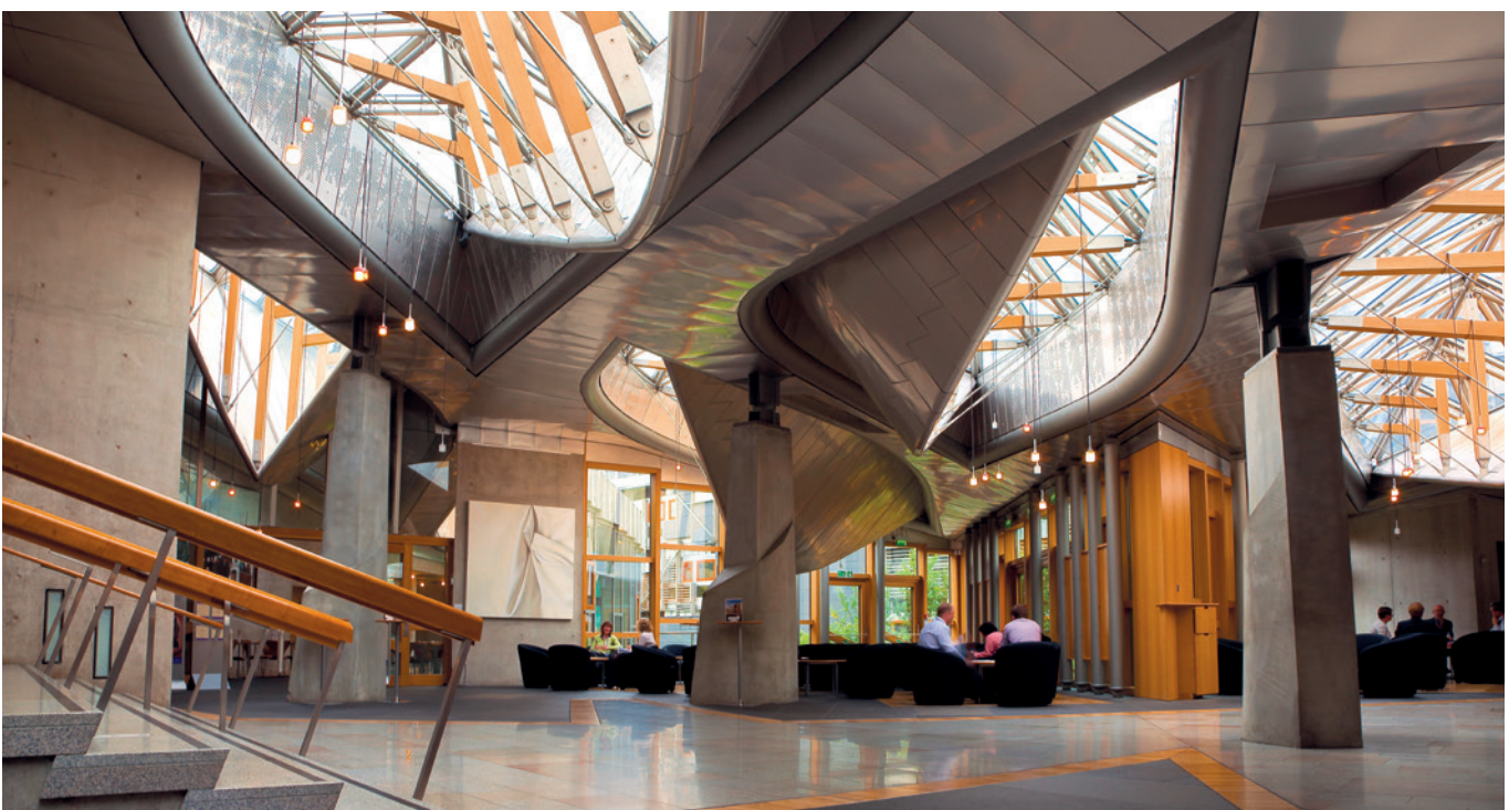
The Garden Lobby

There is a variety of signs in the building, some of which are lit. Staff are also available to help.