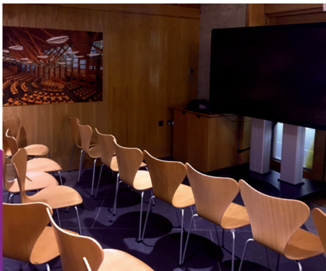
The Chat Room

Chairs will usually be set out in short rows facing the white board at the front. This is an interactive board which the member of staff taking your visit will use during your workshop.